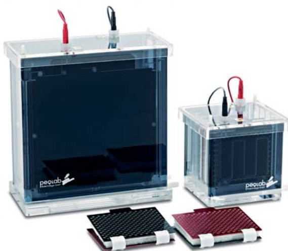
WEB™ M & WEB™ S