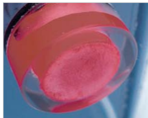
Corrosion-protected electrode junctions