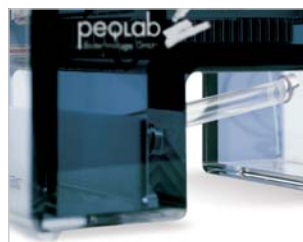
'Revolution' systems avoiding pH and ionic gradients during extended runs.