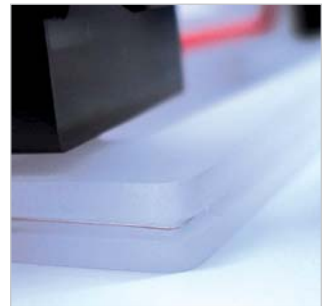
04. Protected anode