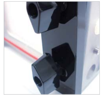
03. Robust side clamps hold the gel in place