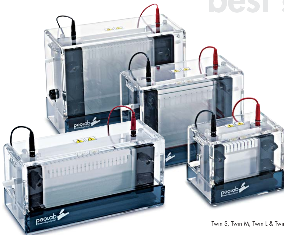
Twin S, Twin M, Twin L & Twin ExW S