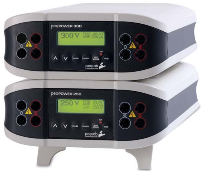
peqPOWER E300 & E250