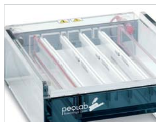
Wide format systems - ideal for material and space saving high throughput separations