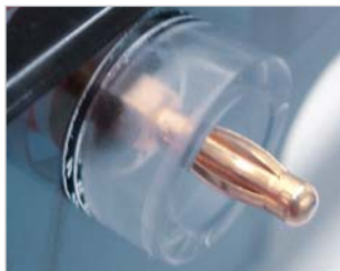
Corrosion-free gold-plated banana plugs