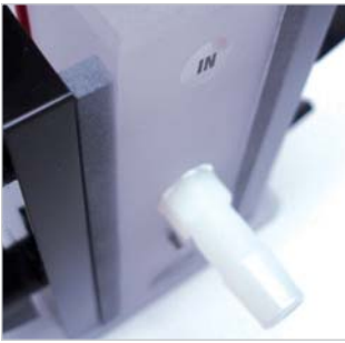
01. Flow cooling system