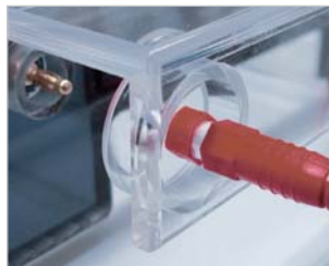
Safety lid offers protection against electric shock