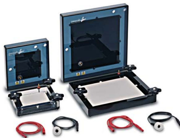
Sedec™ S & Sedec™ M