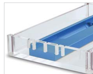
Casting dams for casting smaller gels on large gel trays