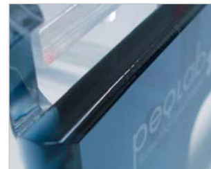
Venting slot helps avoid water condensation