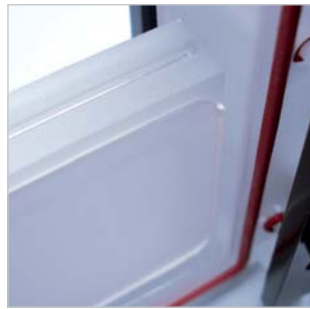
02. 3-cathode configuration